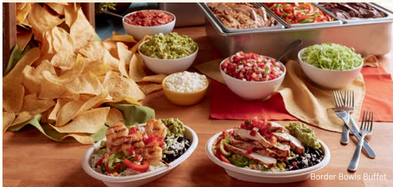
Border Bowls Buffet

[add a skewer of Grilled Shrimp for just 2.99]